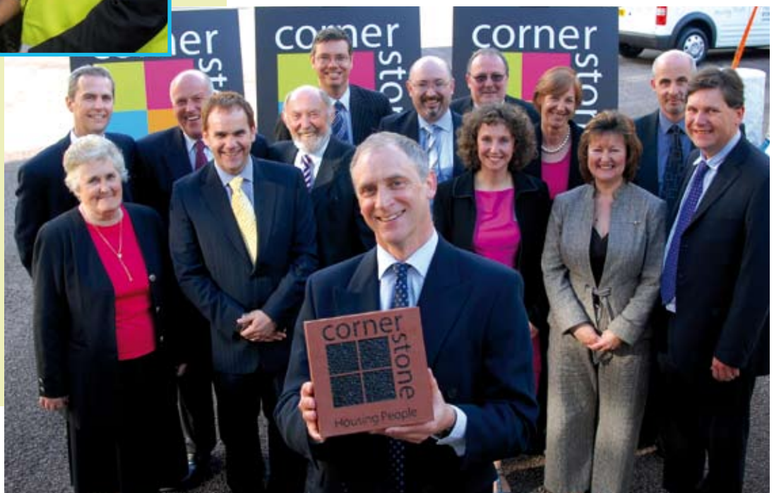
The Executive Team and Board Members.