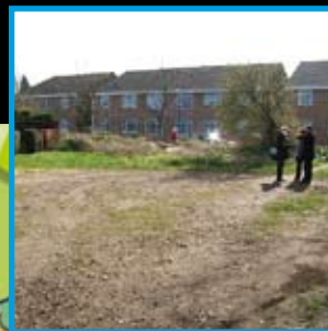
Ottery St Mary

The map shows the area in which we are keen to work and we are seeking opportunities.